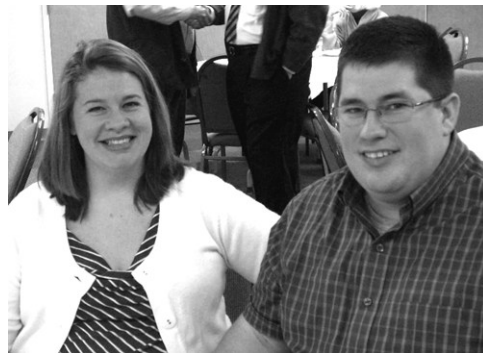
Photos - Ringing in the New Year right at the January 1 New Year's Day Brunch

Coming on February 21, 5-7 PM! Celebrate Mardi Gras St. Catherine's style at the Shrove Tuesday Pancake Supper. Come to the Parish Hall for pancakes, bacon, spiced apples, King Cake, and fellowship. The youth will serve them up from 5 to 7 pm in the Parish Hall. No reservations, suggested donation is $5 for adults and $3 for children. Come out to have fun and support the Youth Program!