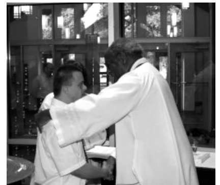
Left — The altar party prepares;