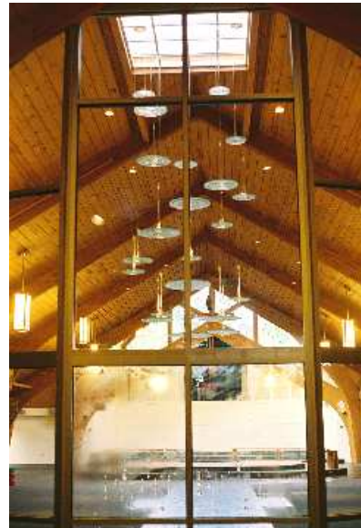
The view toward the altar through the new glass sculpture over the baptismal font.